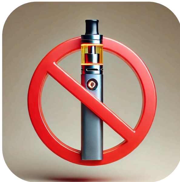
Single use vapes ban poster

Please see attached poster and QR code for more information.